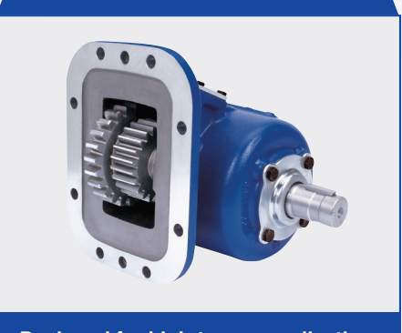
Designed for high-torque applications

Three PTOS designed for versatility, high torque, and heavy-duty applications